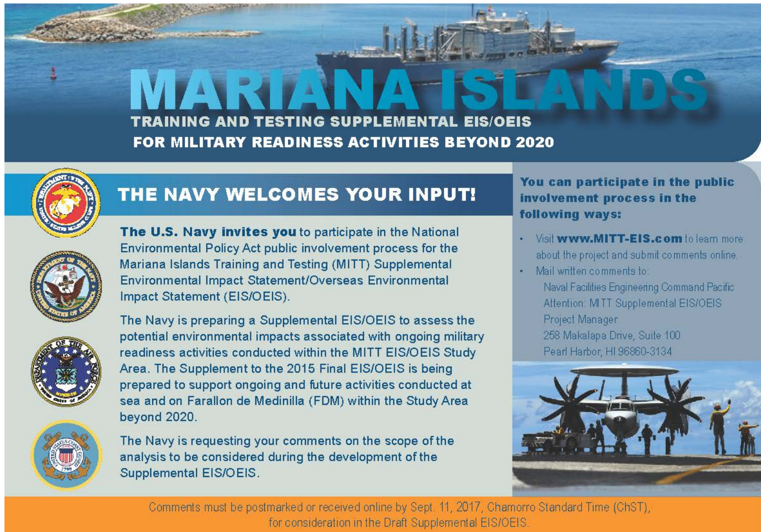
Figure 8-3: Postcard Mailer for Scoping (Front)