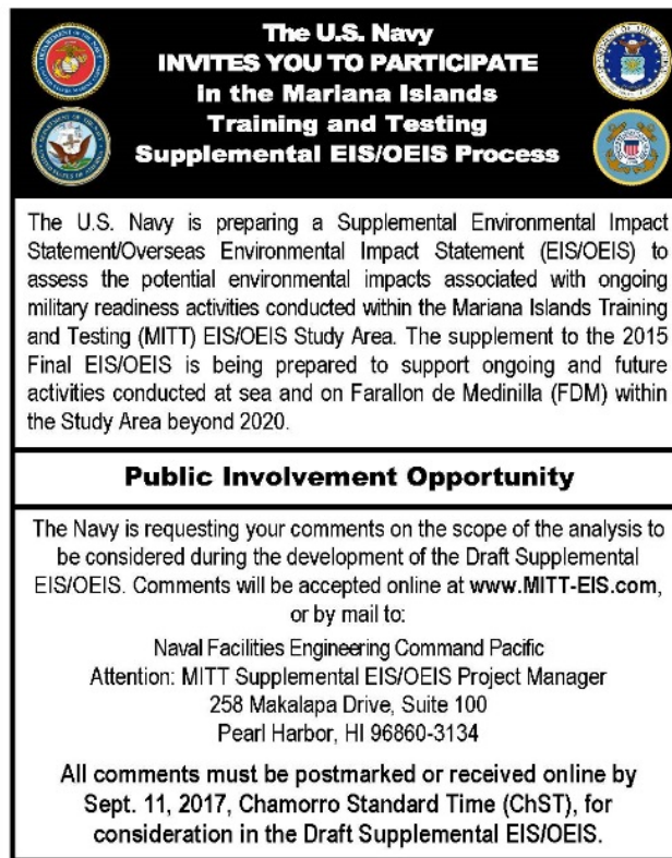
Figure 8-4: Newspaper Announcement of Scoping